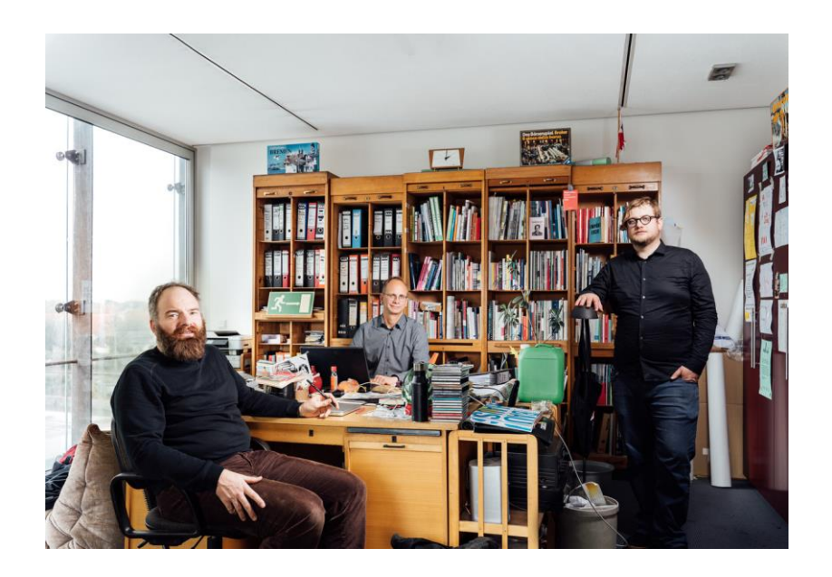
The ZZZ team in Bremen, Germany

The agency is run by an active temporary use crew, the AAA – Autonomes Architect Atelier, with strong networks to users and subcultures. In terms of its governance model, three departments of the municipality (Economic, Labour and Europe; Finances, Climate Protection, Ecology and Mobility; City Development and Housing) fund the agency (EUR 560 000 annually) and are represented in its Steering Group: where necessary, they provide direct connections to civil servants and elected representatives. Delegating this matchmaking role to an external agency in turn prevents the deceleration of the process due to long public competition processes.