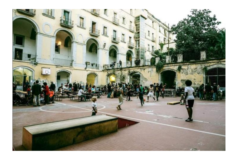
Scugnizzo Liberato in Naples, managed by the commons, Italy

As the implementation of regulations is so varied in all Member States, the Agency and other partners of this action decided to create a handbook for better regulation, with examples and inspirations of administrative acts, regulative skills, and many other useful insights.